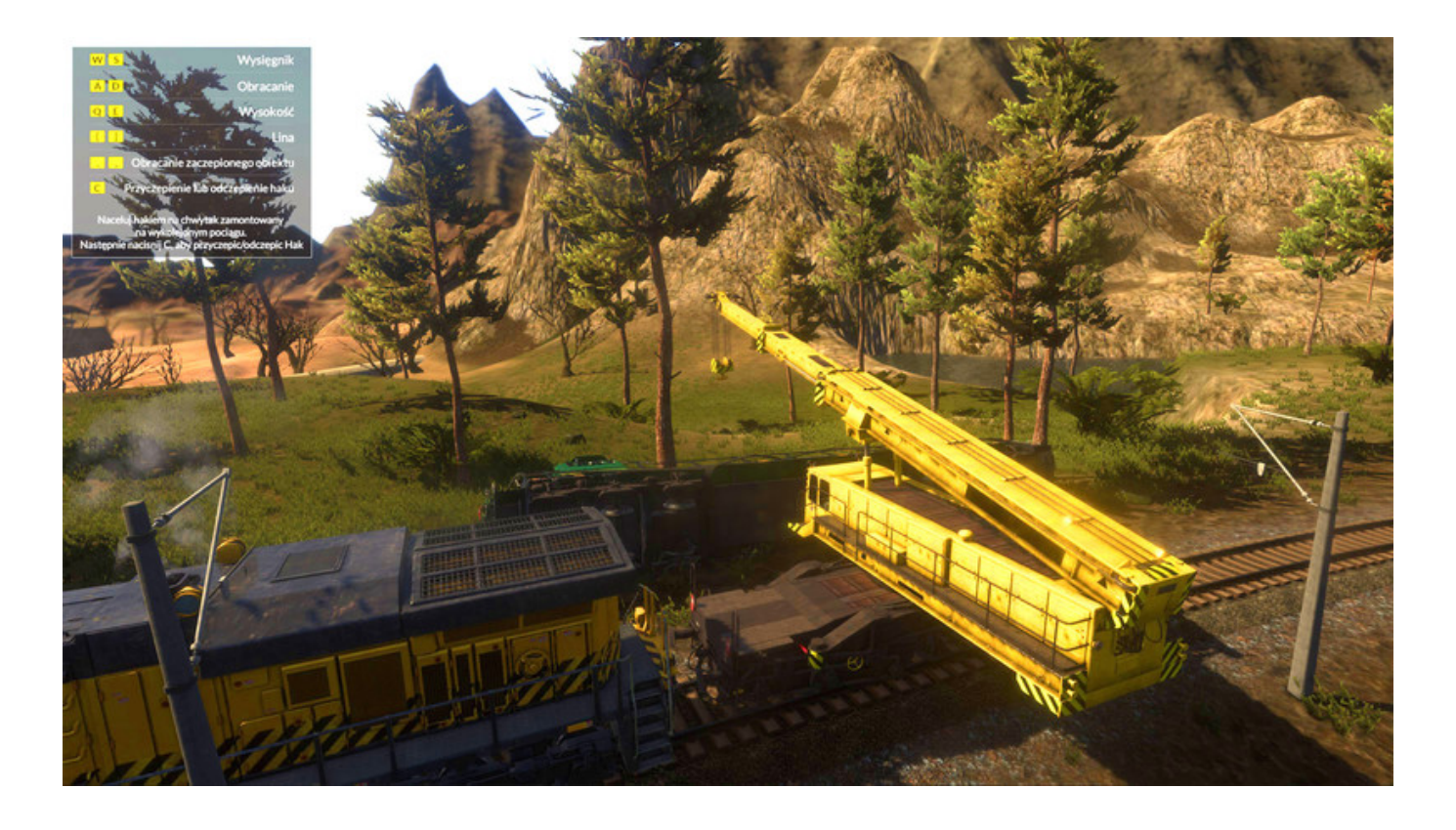
Download ->->-> http://bit.lv/2NINGXe